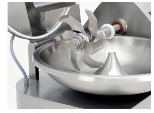
Optional 6-knife head.