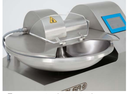
Transparent noise protection cover.