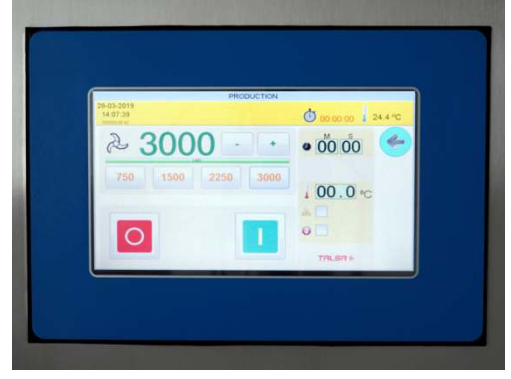
7" digital touch screen.