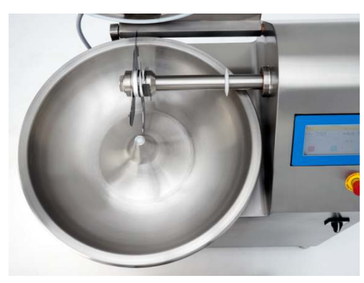
Solid stainlees steel bowl.