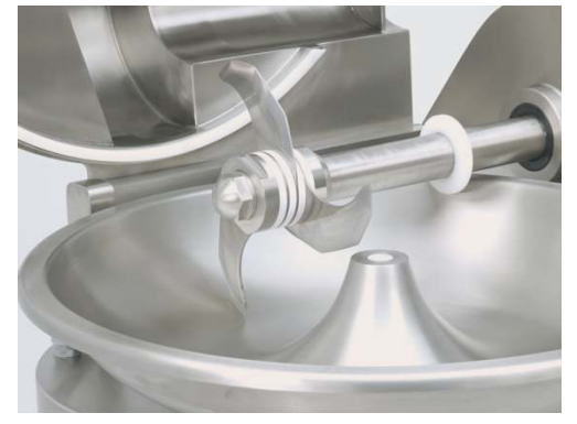
Removable knife head with 3 knives (standard).