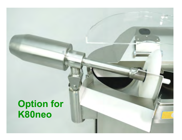
Unloader extracting arm with motorized disc for easy and comfortable unloading.