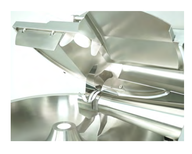
Smooth polished surfaces , no corners or screws, with CE radius for easy cleaning.