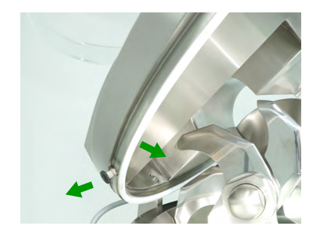
Removeable lid/bowl friction band to facilitate cleaning.