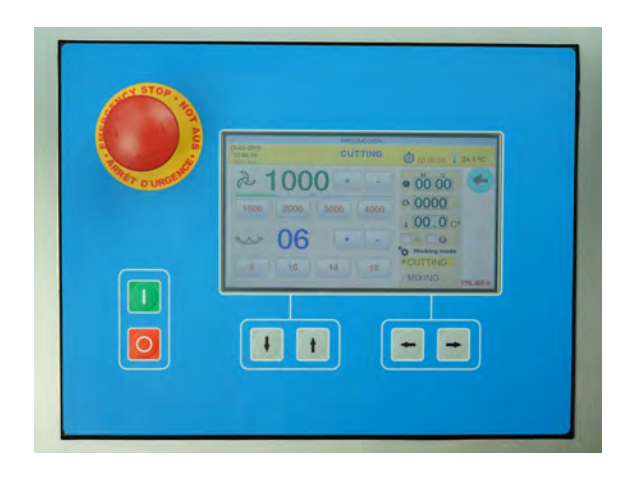
Digital display to control and program all functionalities of the cutter.