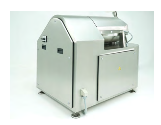
Very solid construction. Large openings to access the interior.