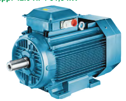
Extra power (PowerPlus) for heavy applications.