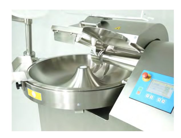
Stainless steel motorized knife lid for effortless lifting and lowering.