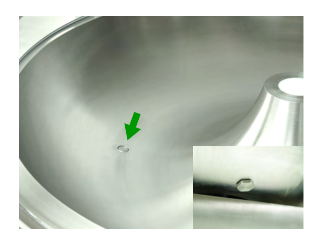
Bowl with drain plug with automatic positioning.

Standart power: K50nb: 22.5 HP / 16,5 kW