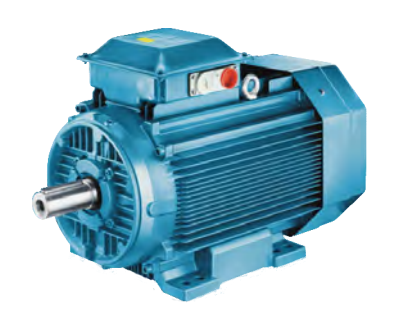
Powerful ABB knife motors to process compact and dogged meat.