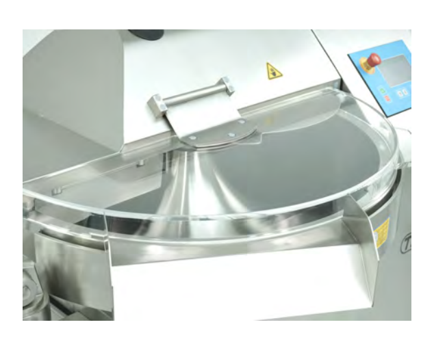
Noise protection cover with automatic decrease of knife speed.