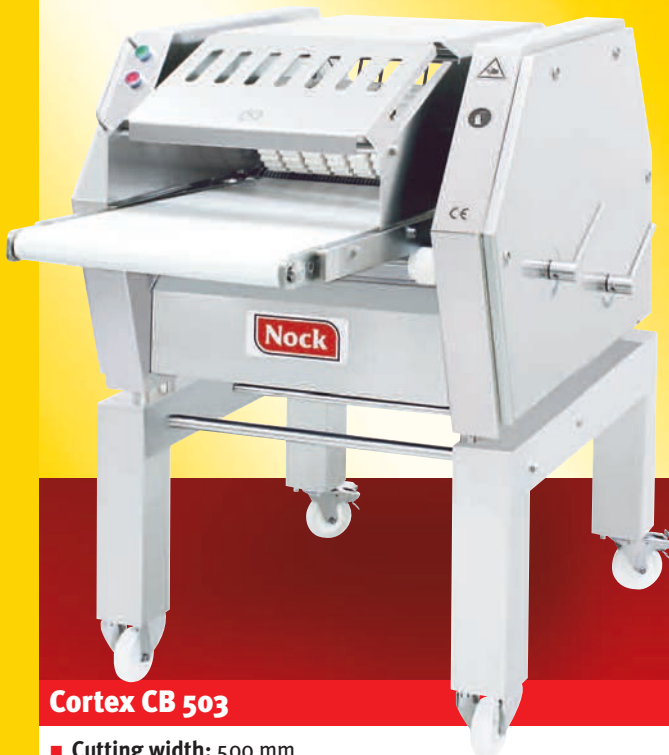
Cortex CB 503

The conveyORIZED NOCK derinding machines for industrial use are equipped with long conveyors and operate with high cutting speeds. They may not be operated in open top (manual) operation.