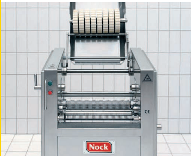
Quick and easy to clean: NOCK derinder after removing conveyor, pressure roller and blade holder. Scraper comb tilted back.

Conveyors, pressure roller, blade holder, exchangeable tables and output sheets can be removed and replaced for cleaning purposes from the machine within seconds without any tools. Therefore soiled parts are easily accessible. The scraper comb can be tilted downwards, the transport roller can be turned by hand. The conveyor frames can be folded back so that the inside of the conveyor can be cleaned. The belts can also be easily removed from the frames for thorough cleaning. The machines can be optionally equipped with plastic modular belts.