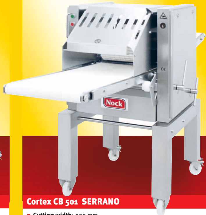
Cortex CB 501 SERRANO