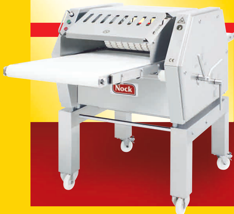
Cortex CB 604 with ASG