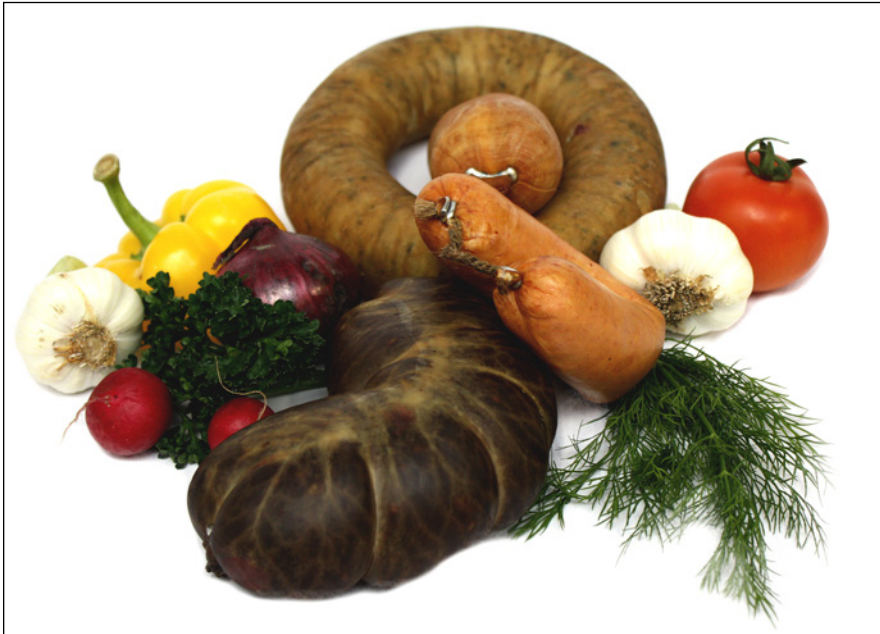
Natural casing sausages with flat clips