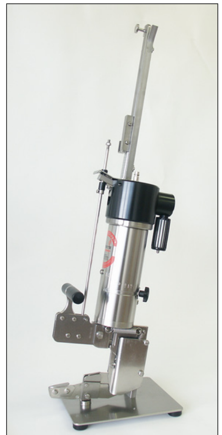
Pneumatic cutting knife