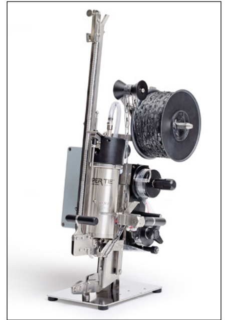
TCNV with automatic loop feeder